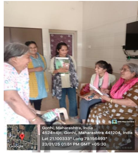
Students interact with the people in the Old Age Home.